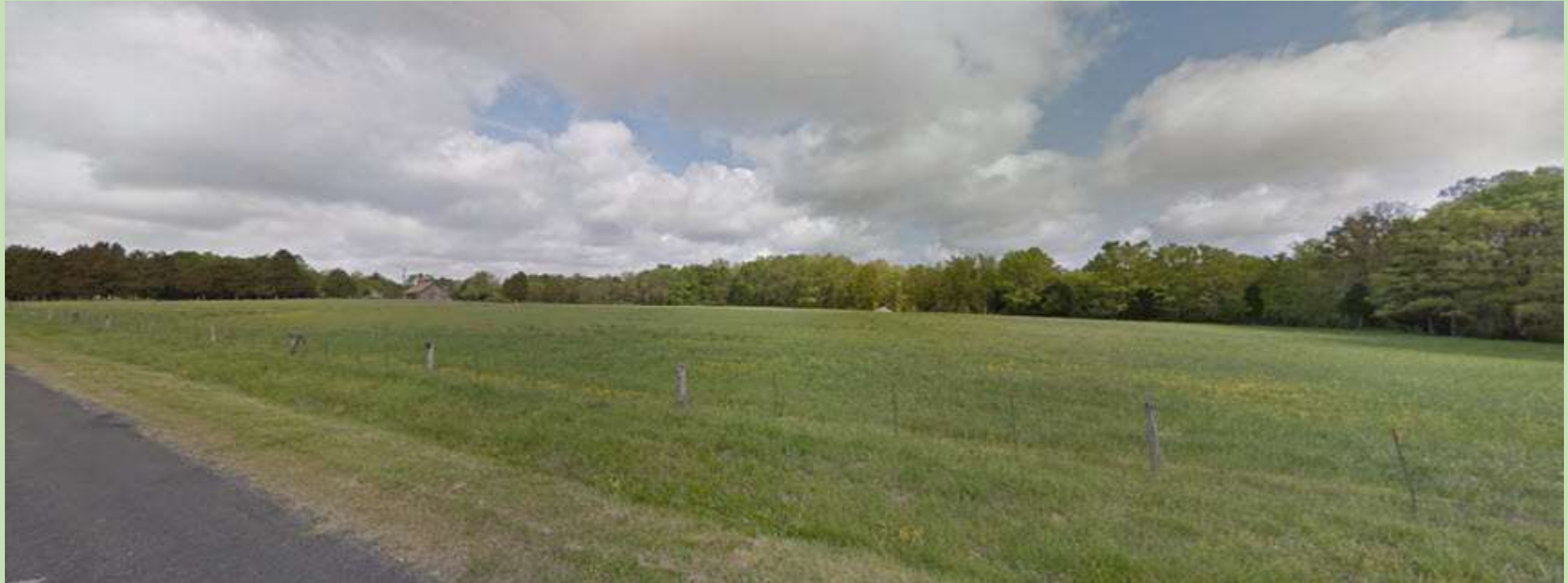
Photo below shows the pasture area along Auten Rd with the log house in the background. There are no power lines or gas lines crossing this property. No traffic noise from I-77. York County Natural Gas is available on Marshall Rd as well has high speed internet. Property is served by York Electric Cooperative and Comporium Communications.