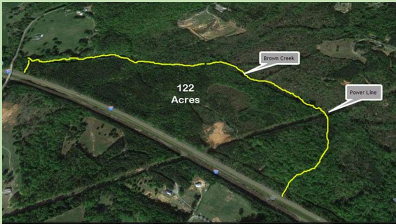
Photo left shows in proportion the 4,200+ feet of frontage along I-77 and how much exposure this tract will have to the 52,000 vehicles per day. SC Dept. of Transportation has a Vegetation Management program that allows property owners to clear trees from the road right-a-way. Call or email to receive information pdf file on this program.

Photo right shows the present view from I-77, along most of this tract the road bed is on the same grade as this property.