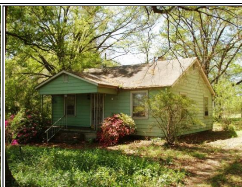
823 Cell River House