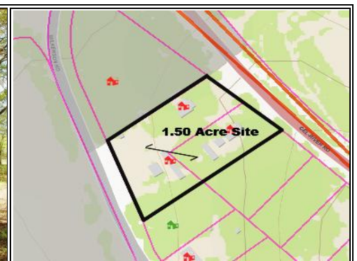
Tax map showing Topo or Terrain

Note: All information stated above and any other associated with this property is deemed to be accurate but not guaranteed or warranted by REID Real Estate Inc, its Agents nor the Property Owner/s. All information subject to change.