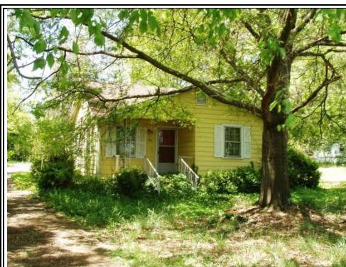
833 Cell River House