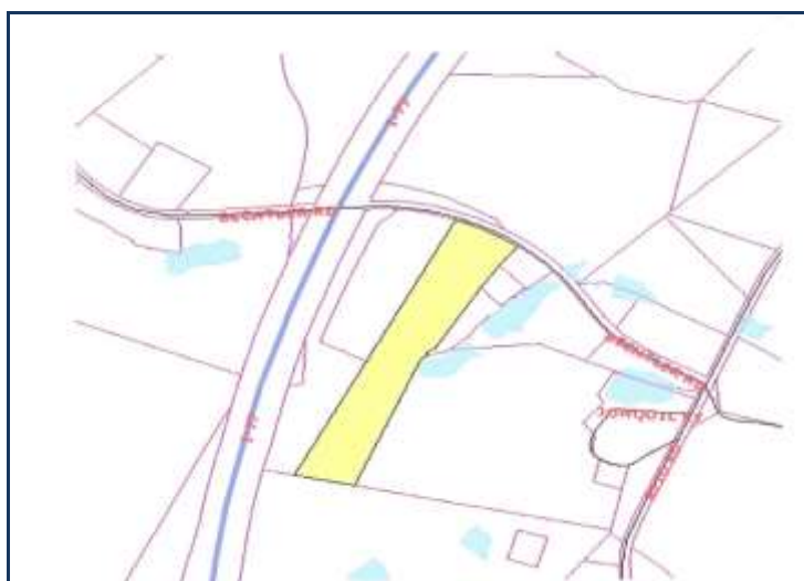
Tax map showing the land highlighted in yellow

20.75 Acres in the southern part of York County. 542' of paved Road frontage – Bechtler Rd. Convenient to I-77 via Hwy. 901 to Reid Rd. and Bechtler Rd. 2.25 miles to the Hwy. 901 interchange. Good topography over most of this tract and good red clay based soil, some creek bottom area about 2.3 rd s of the way into the tract, great site for large spring fed pond. Tract was surveyed in 2006. This tract was thinned of the timber in 2010 but the listed price reflects the lack of timber.